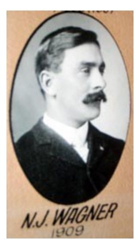
Jeweler Fly Net Factory Owner Buick Mechanic & Guide

He died April 3, 1940, in Flint, Genesee County, Michigan. He was buried in Naperville Cemetery with Masonic Rites held at the grave.